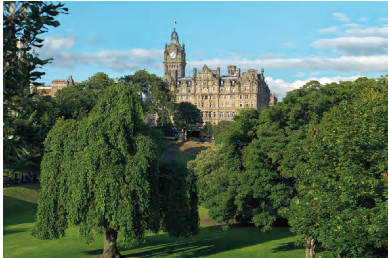
Michelin-starred modern Scottish dining at Number One restaurant and afternoon tea at Palm Court – both Edinburgh institutions