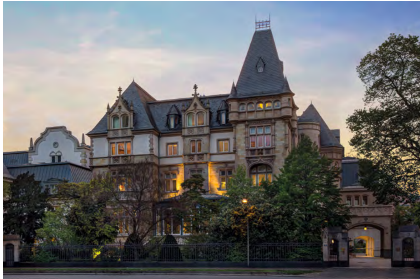
Original owners the Speyer family held frequent at-home concerts here with friends Richard Strauss and Hugo Becker. It remains a favourite destination amongst Frankfurt locals