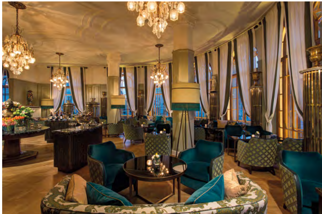
Beloved for its inventive Russian restaurant, 24-hour bar and exquisite afternoon tearoom, the Astoria has played host to everyone from Rasputin, Lenin and Bulgakov to The Doors, The Rolling Stones and Pavarotti