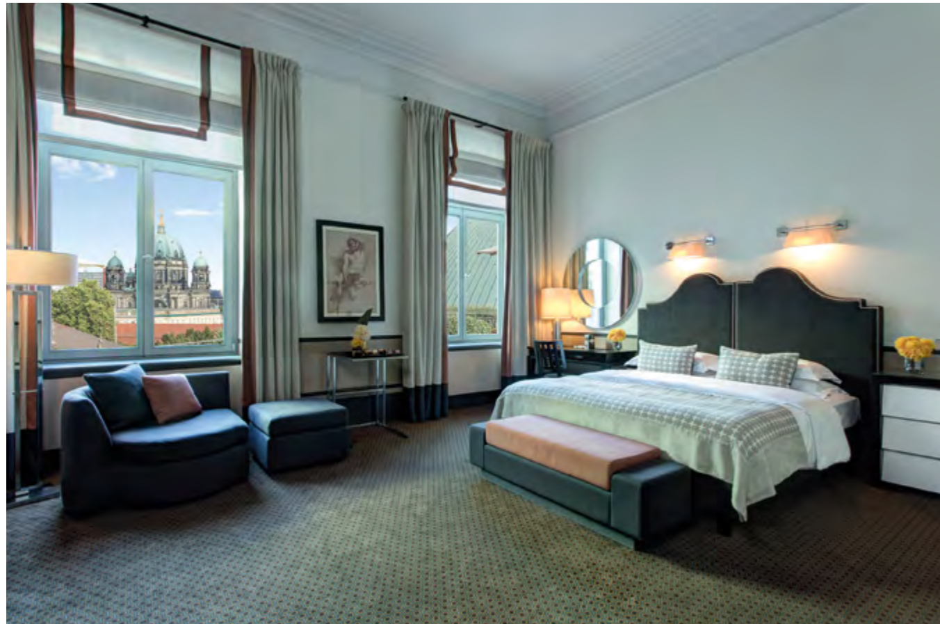
Hotel de Rome takes its name from a renowned inn that once sat on Bebelplatz, the striking square which many rooms and suites overlook