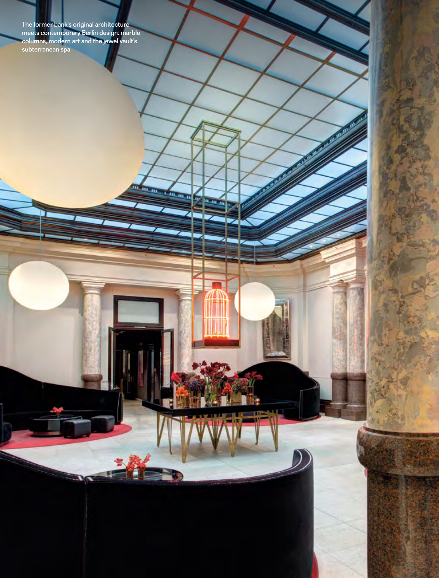
The former bank's original architecture meets contemporary Berlin design: marble columns, modern art and the jewel vault's subterranean spa