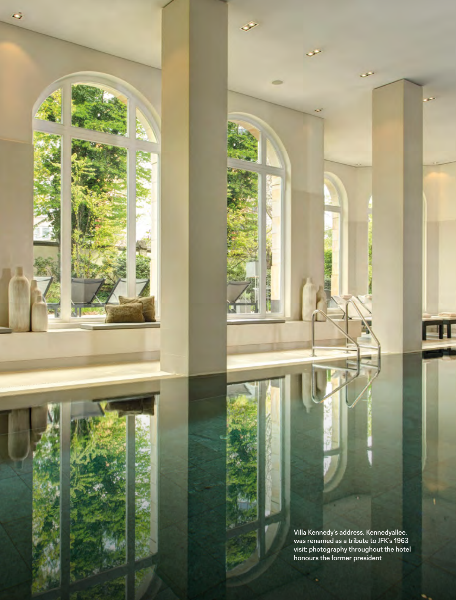
Villa Kennedy's address, Kennedyallee, was renamed as a tribute to JFK's 1963 visit; photography throughout the hotel honours the former president