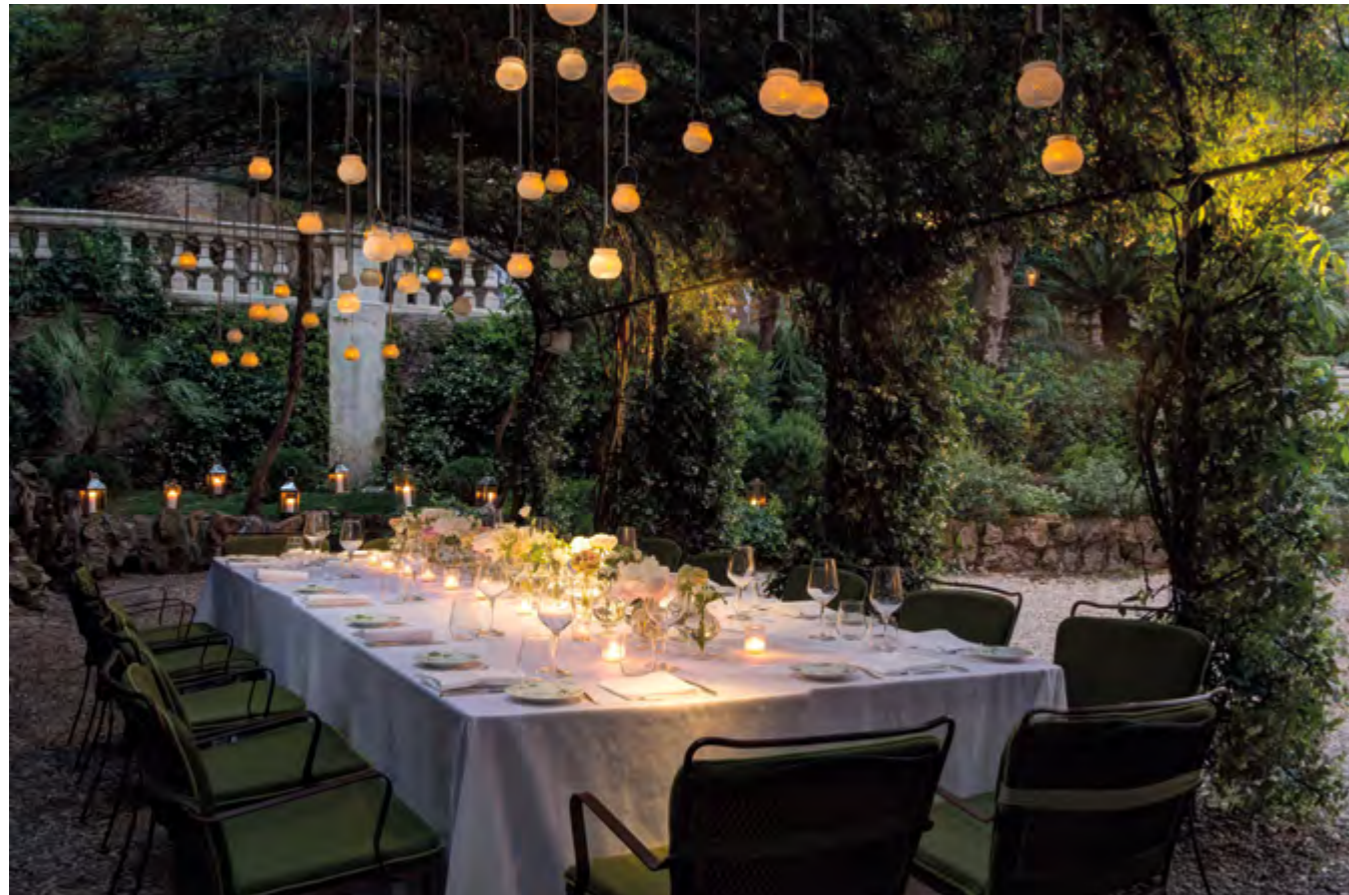
Hotel de Russie was designed in the early 1800s by architect Giuseppe Valadier, who also developed Piazza del Popolo, which the hotel overlooks