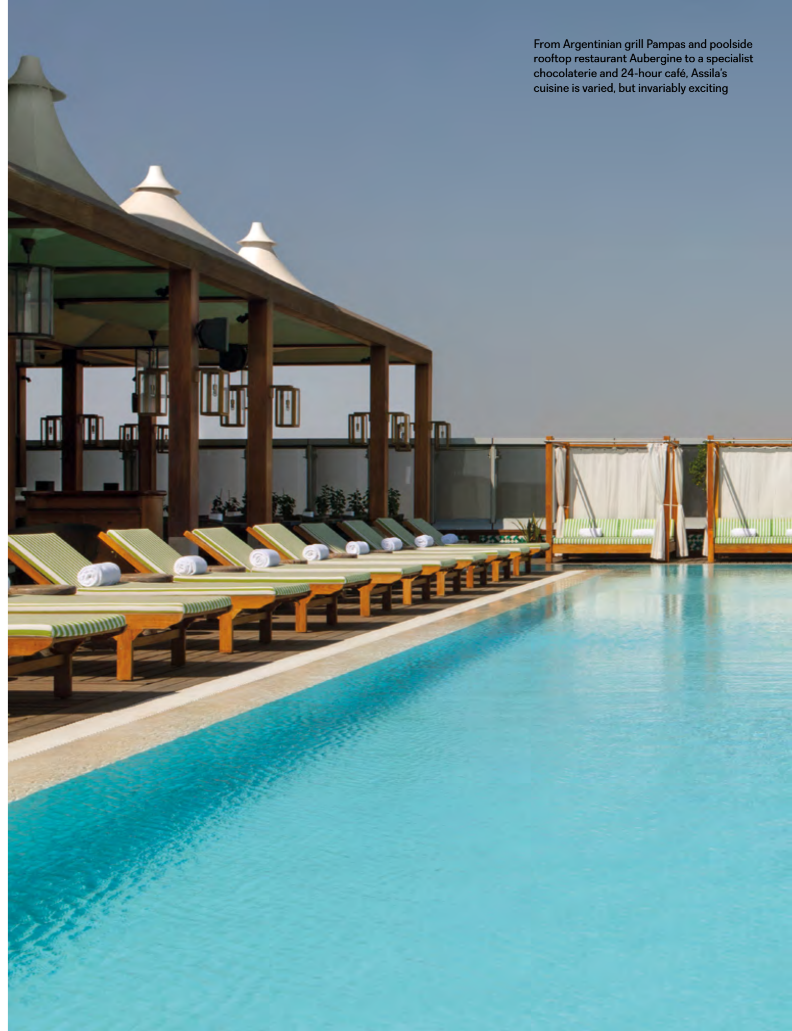
From Argentinian grill Pampas and poolside rooftop restaurant Aubergine to a specialist chocolaterie and 24-hour café, Assila's cuisine is varied, but invariably exciting