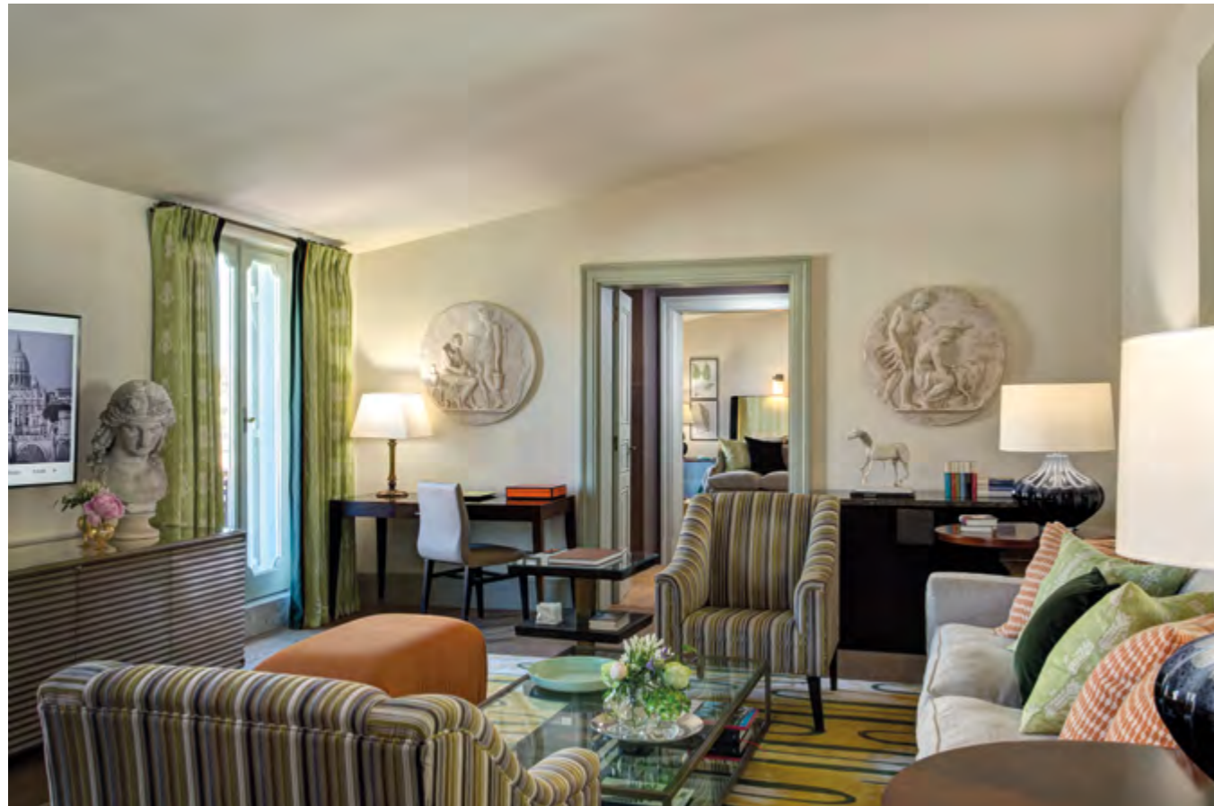
Jean Cocteau and Pablo Picasso stayed at Hotel de Russie, in adjoining rooms, while preparing to stage the first ever Cubist ballet in 1917