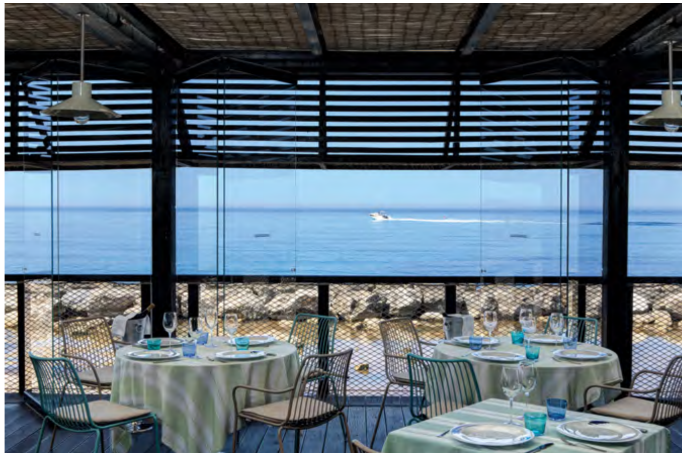
Verdura's coastline sits just west of the charming Baroque village of Sciacca; fish comes fresh from the local market, oil from Verdura's own gardens