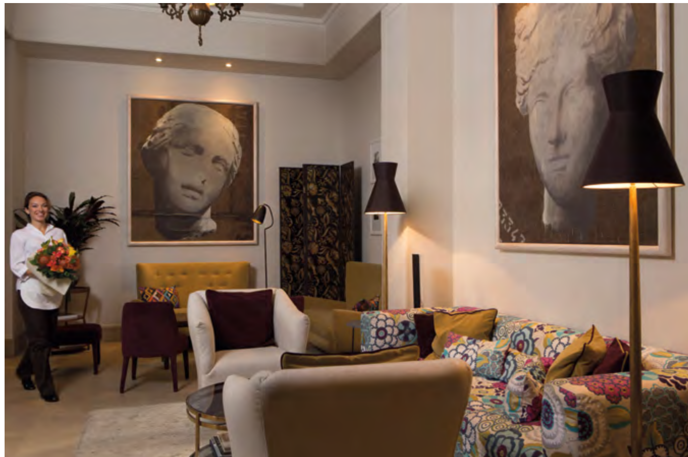
Built in 1893 on the former site of the Mercato Vecchio and church of San Tommaso, Hotel Savoy's centrality and conviviality quickly made it the city's top hotel