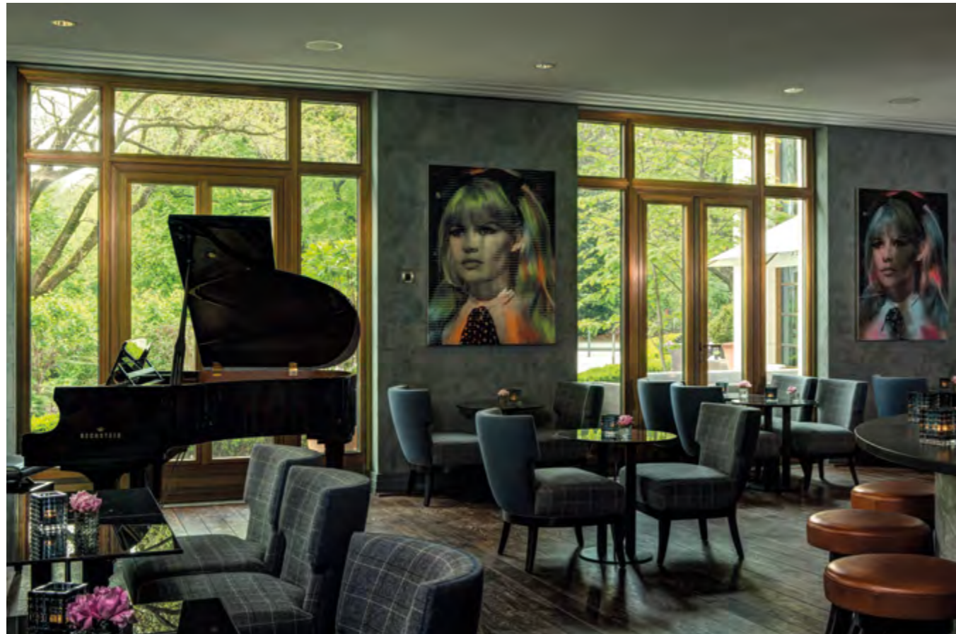
An animated city-centre hotspot, Sophia's Restaurant & Bar, left, serves imaginative botanical cuisine and cocktails to guests and locals